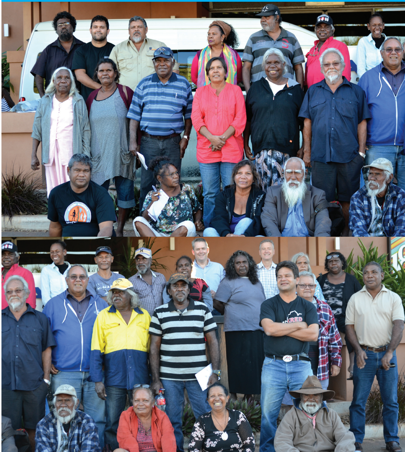
Nyikina Mangala & Karajarri Traditional Owners after several long days of negotiations with Buru Energy in Broome